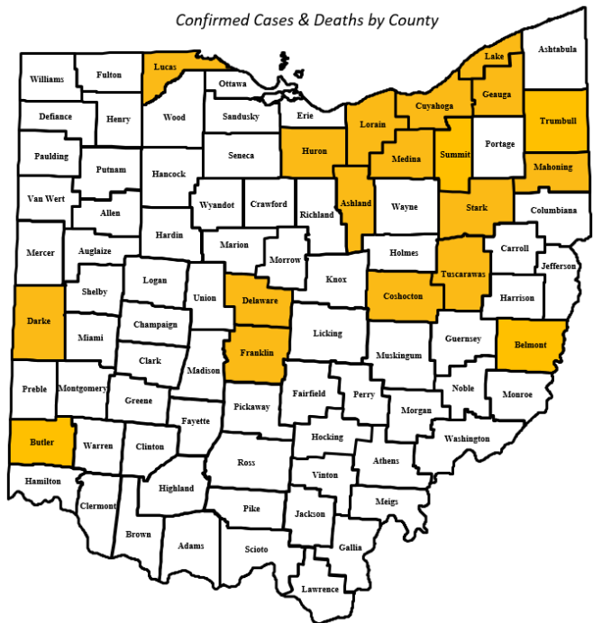
Confirmed Cases & Deaths by County

COVID-19 numbers provided by ODH daily at 2:00 PM